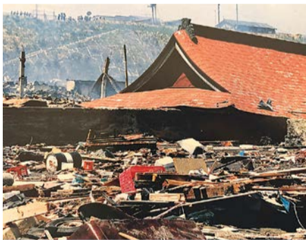
The destruction was massive. Much of the town of Okushiri was leveled or swept into the sea.

There, my mentor serves as the head priest of Nitcho-ji Temple. Some of you might have heard of Okushiri Island before. It became nationally known from the devastation it suffered from