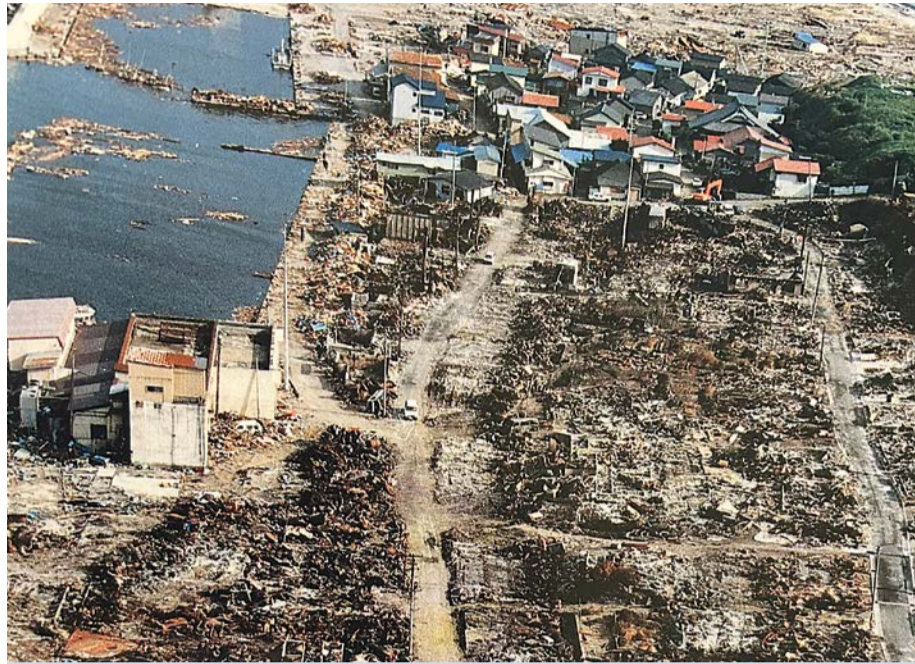
The Southwest Hokkaido Earthquake in 1993, along with the tsunami, landslide, and fires that followed, killed 202 people and nearly completely destroyed the town of Okushiri. 28 people were never found.

the Southwest Hokkaido Earthquake on July 12, 1993 at 10:17 p.m.