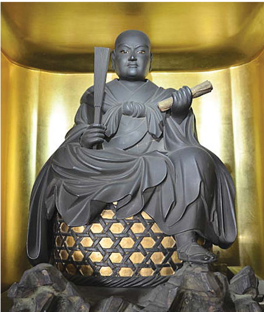
Statue of Nichizo Shonin at Hokkeji Temple in Kyoto.

His achievements in the expansion of Nichiren Shu temples in Kyoto command our profound respect. His genuine courage and indefatigable perseverance, along with energy and wisdom, are worthy of our profound respect. Furthermore, we cannot overlook the idea that our Founder Nichiren Shonin was able to see the extraordinary talent of a 13-year-old boy and to have the keen foresight to task Nichizo with the important duty of spreading Nichiren Shu Buddhism in Kyoto.