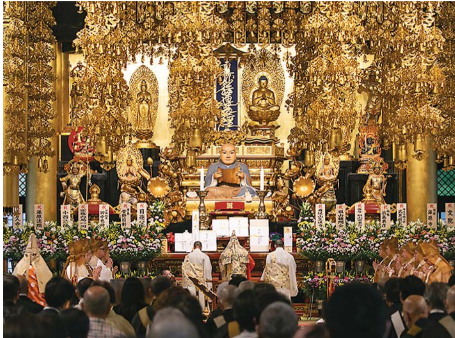
The altar in Minobusan Kuonji Temple's Main Hall embodies all the elements of the Great Mandala Gohonzon.

It is important to rely absolutely on the true teaching of the Lotus Sutra to change this Saha World into the Pure Land. Unless we keep faith in the