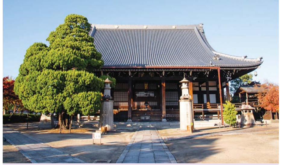
Myokenji Temple in Kyoto was established by Nichizo Shonin in 1321.