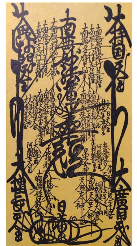
The Most Venerable One revealed and described by Nichiren Shonin.

There is no doubt about the life-saving light illuminating all Ten Realms. The Most Venerable One shows that all of us can become a Buddha through the light of Namu Myoho Renge Kyo . Furthermore, when we sit in front of the Great Mandala, all present conditions of our minds are shown like a mirror. This is why it is important not to see a Buddha far in a distance but to find that we are compassionately enshrouded by the Buddha and other attendants. Thus, we can be reassured by the Eternal Buddha that we, though ordinary beings for now, are getting closer to the realm of the Buddha.