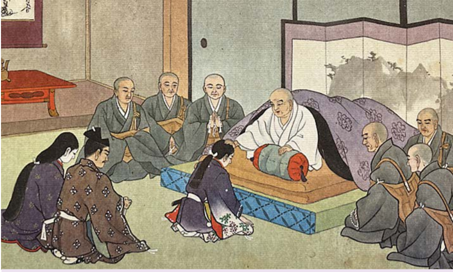
Nichiren Shonin entrusting Nichizo with the important mission of spreading the True Dharma in Kyoto.