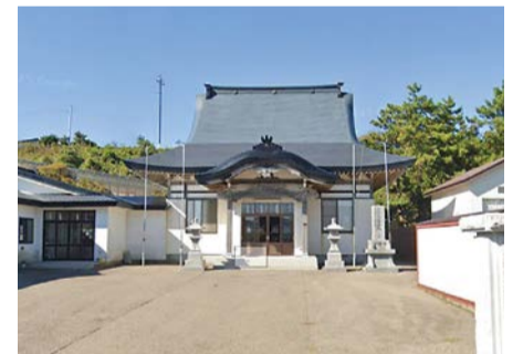
Nitcho-ji Temple was destroyed by fire following the earthquake in 1993. The current temple structure was rebuilt in 1996.